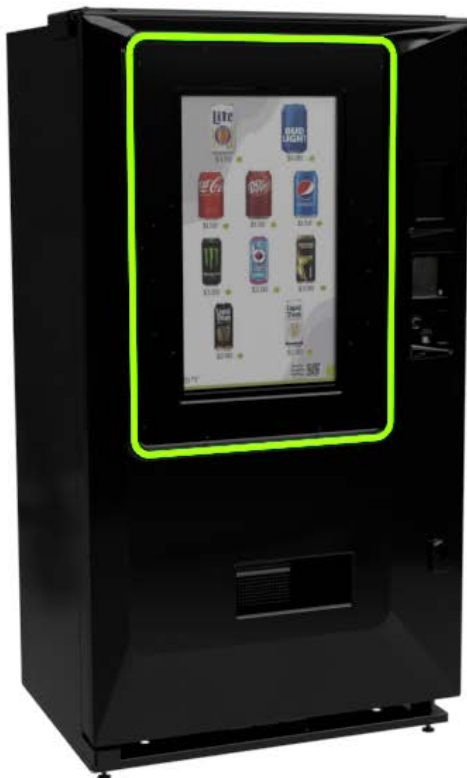
V21i, IoT Vendor

Contact SandenVendo America for more information.