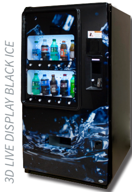
3D LIVE DISPLAY BLACK ICE