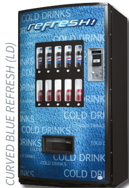
CURVED BLUE REFRESH (LD)

The classic column stack machine features flexible product loading, interchangeable control boards, self-priming vend mechanisms, energy efficiency, reliable vending, and easy servicing.