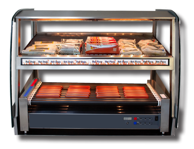
*Roller grill not included.